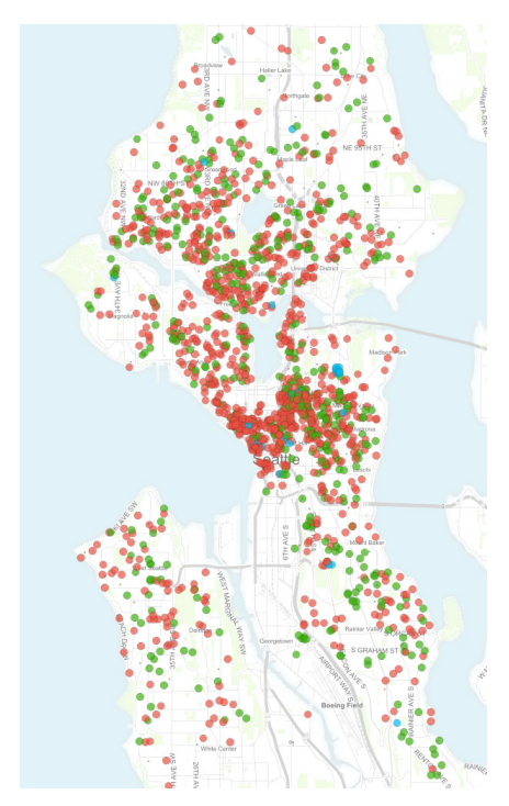
Estimated AirBnB rental reviews in Seattle in July 2013 (top) and July 2015 (bottom). Data from insideairbnb.com