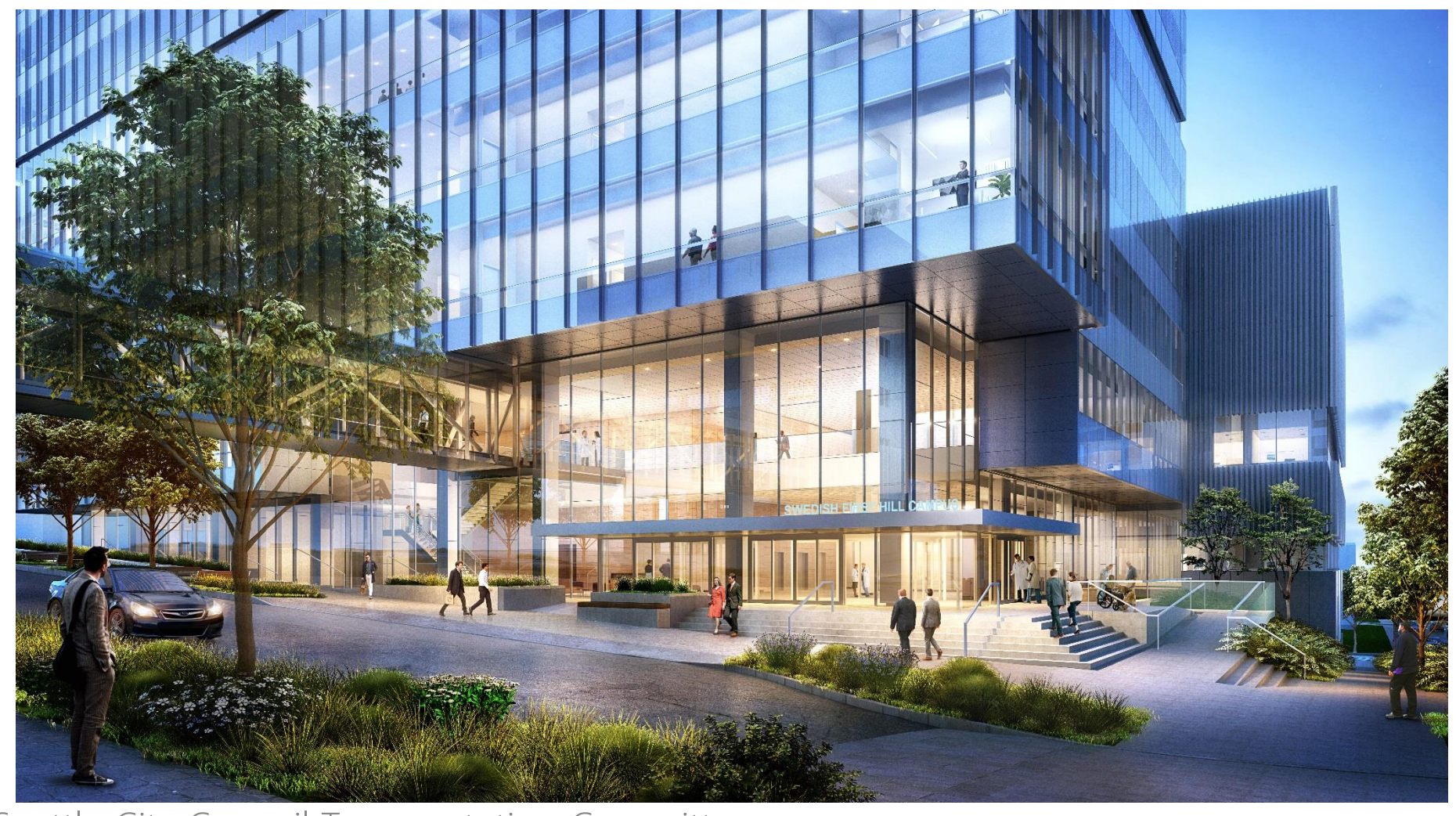
Seattle City Council Transportation Committee