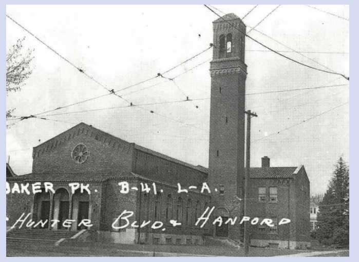
Historic photo, c. 1930s