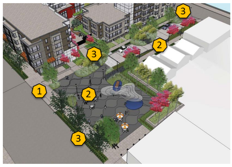
12<sup>th</sup> AVE. SQUARE PARK & WOONERF