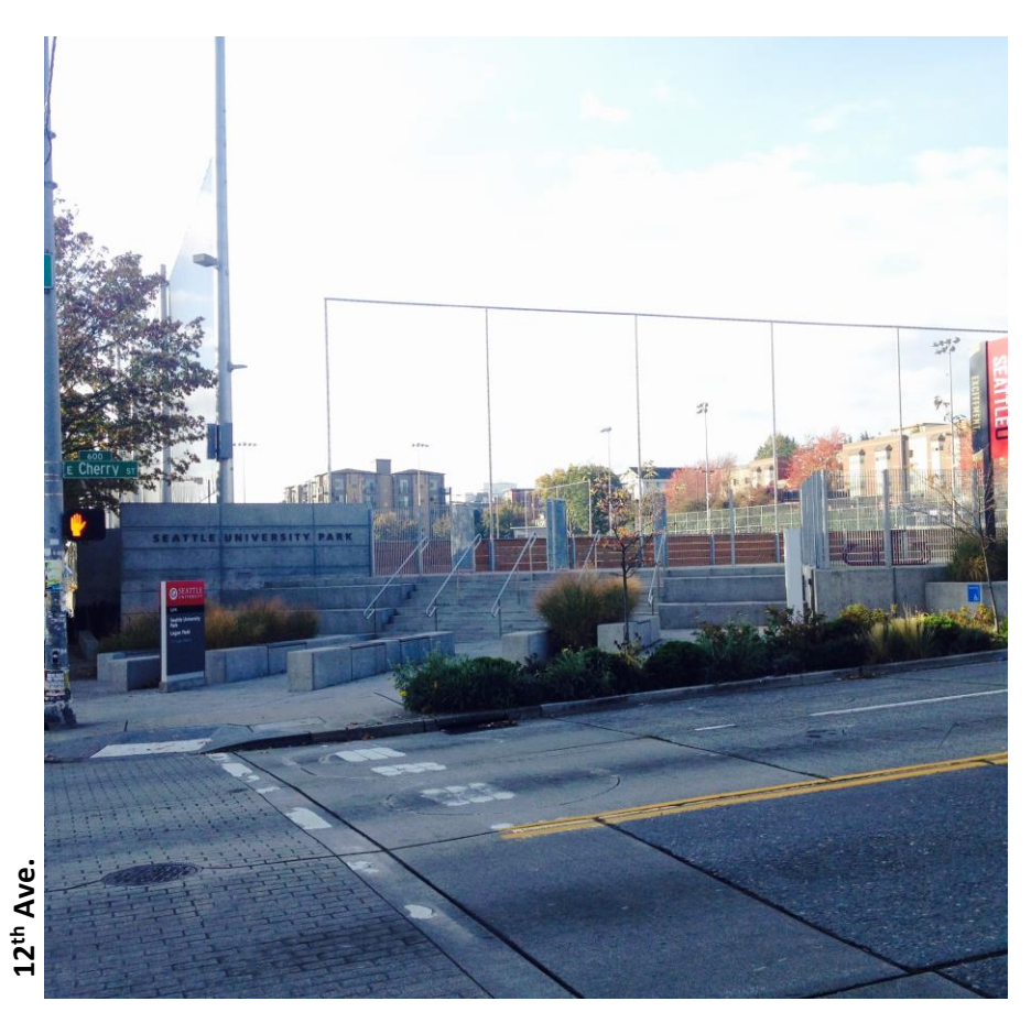
E. Cherry St.