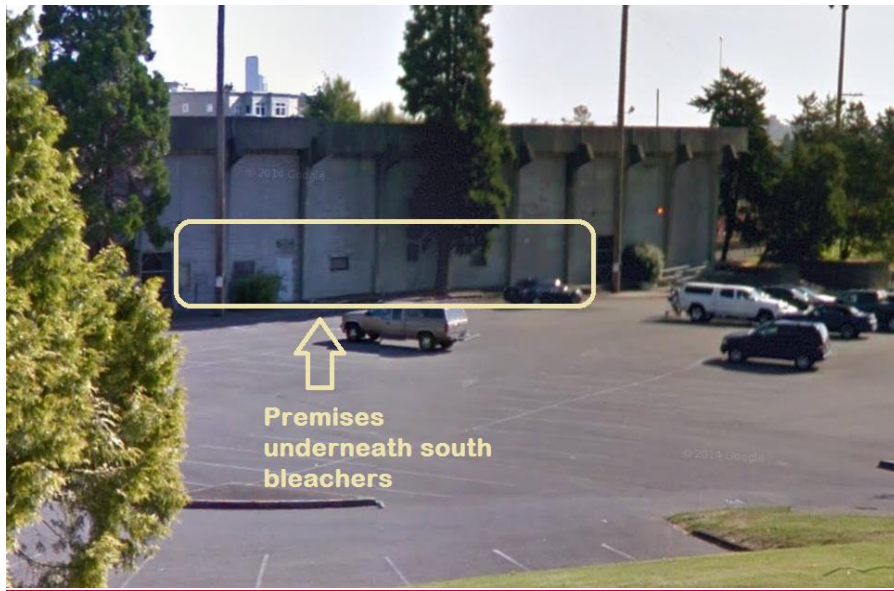
EXHIBIT A (PAGE 2 of 2)