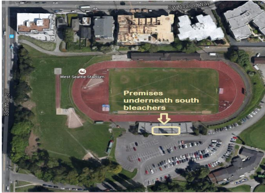
EXHIBIT B Legal Description LEGAL DESCRIPTION

That part of SW1/4SW1/4 of Section 13, Township 24 North, Range 3 East, lying south of Block 13, West Holme Addition, East of 35th Avenue S.W. and West of 31st Avenue S.W. extended.