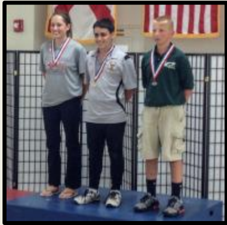
West Seattle Junior Totems