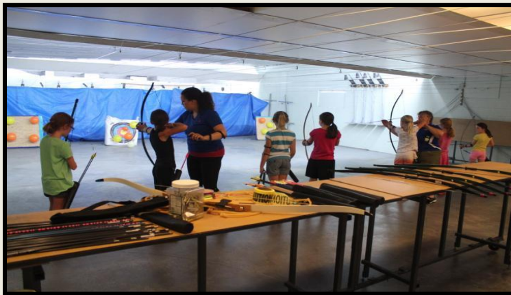
Girl Scouts troop at range for Archery training