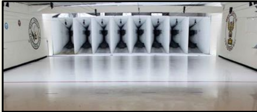
Roger Dahl 50' Indoor Small Bore Range