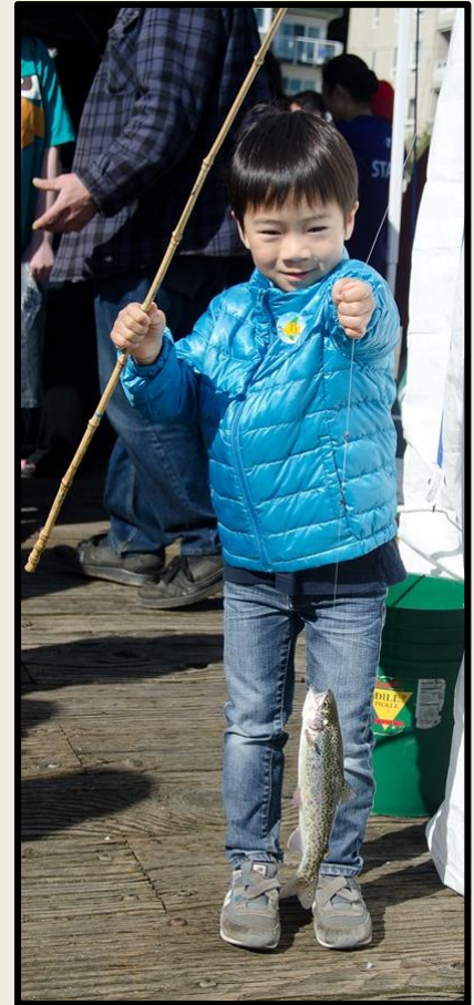
Annual Fishing Derby