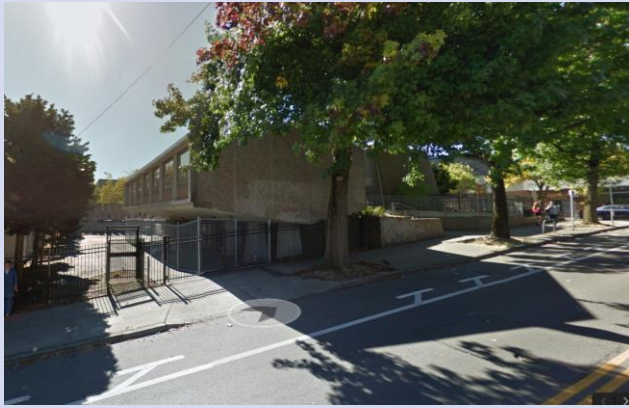
Current photo, 2016