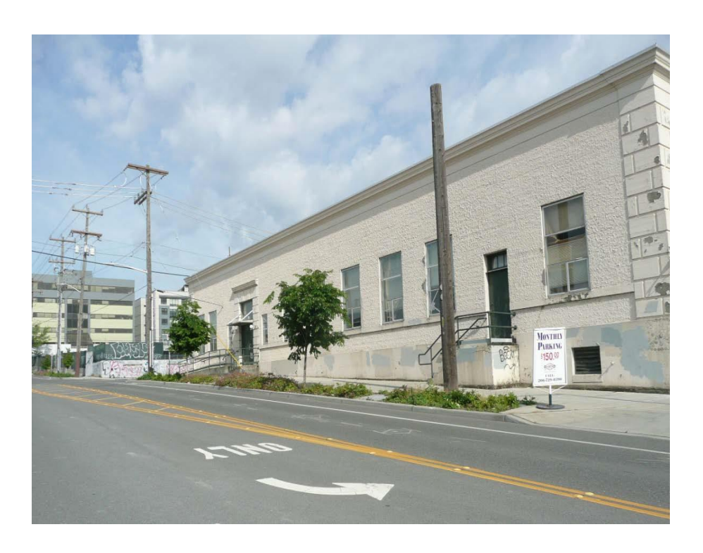
South side from Roy Street (above) and north side and parking lot from Aloha (below).