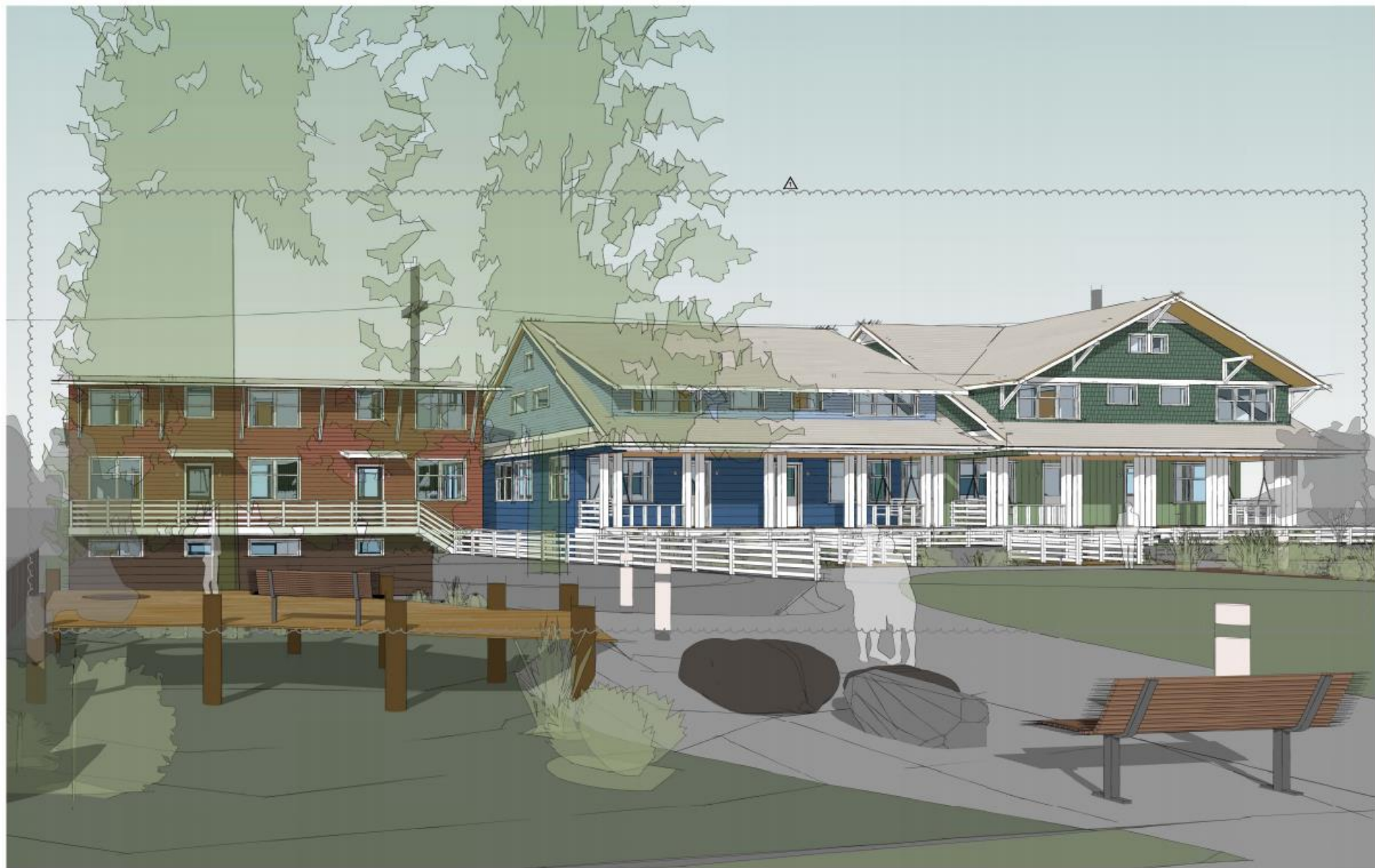
Detail from HE Exhibit 3, Cover Sheet, Sheet A00