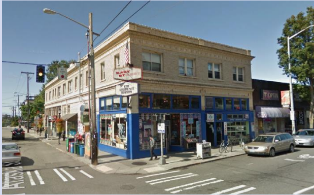
Current photo, 2017