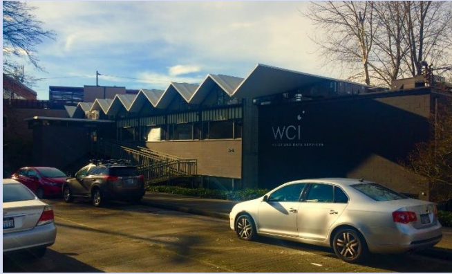
Contemporary photo, 2017