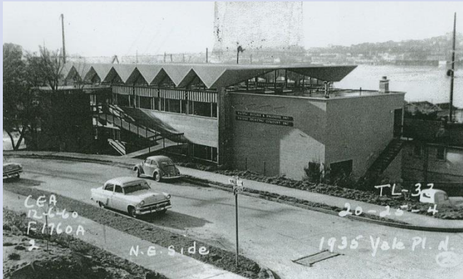
Historic photo, 1960