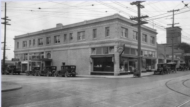
Historic photo, 1926