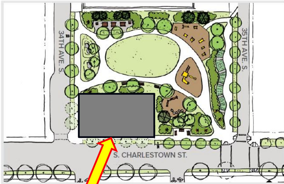
Excluding Parcel: Corner Sightlines Blocked