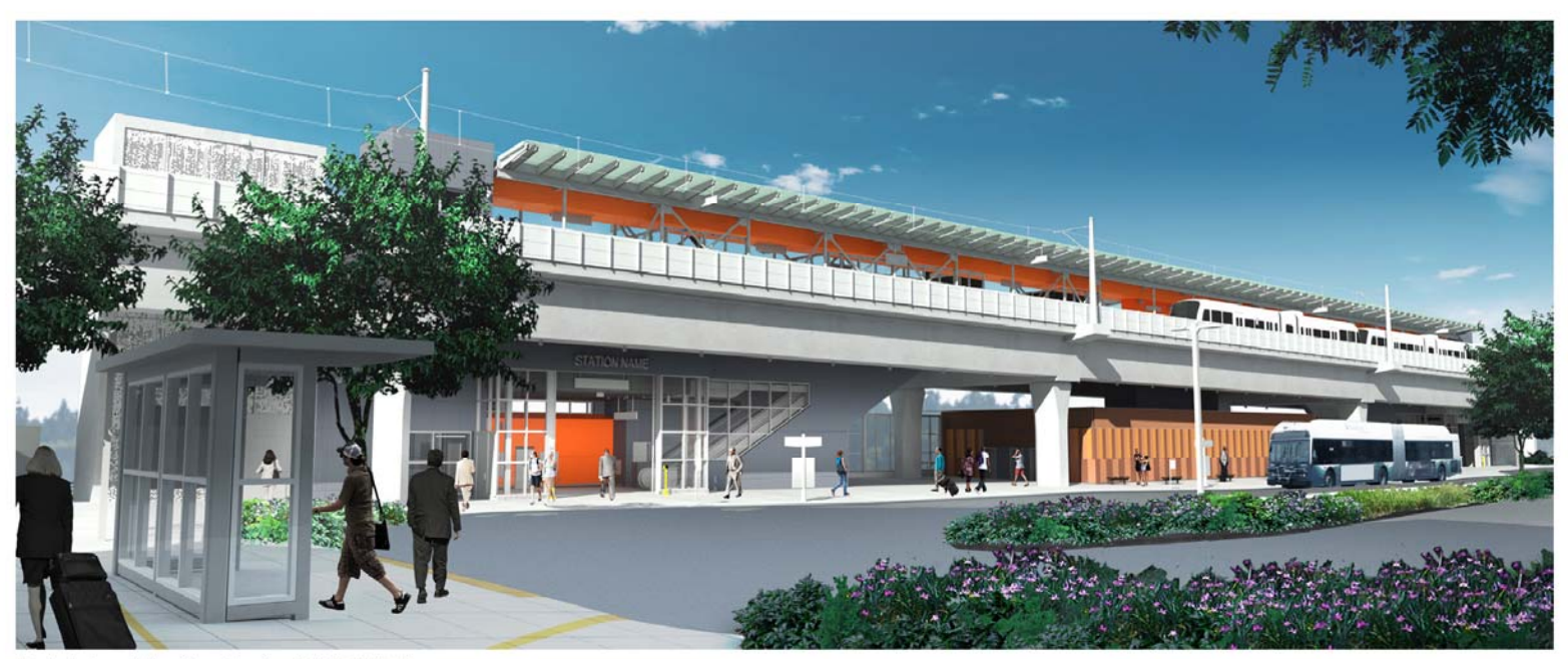
Early design of the Shoreline South/145th Station