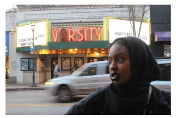
Portraits of Resilience: University District

RESULT: Inclusive engagement plan created. Communities of color engaged in creative strategies in partnership with Resilience and Food teams.