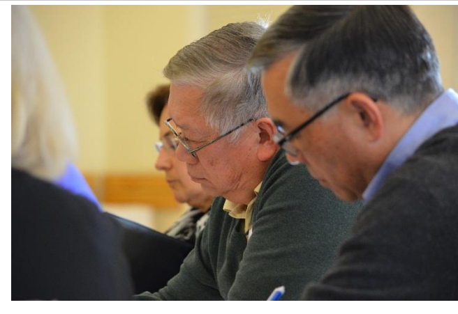
"Community Vision and Voice"