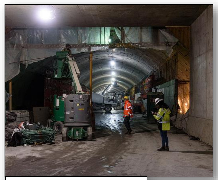
Work on the southbound (upper) roadway of the SR 99 tunnel