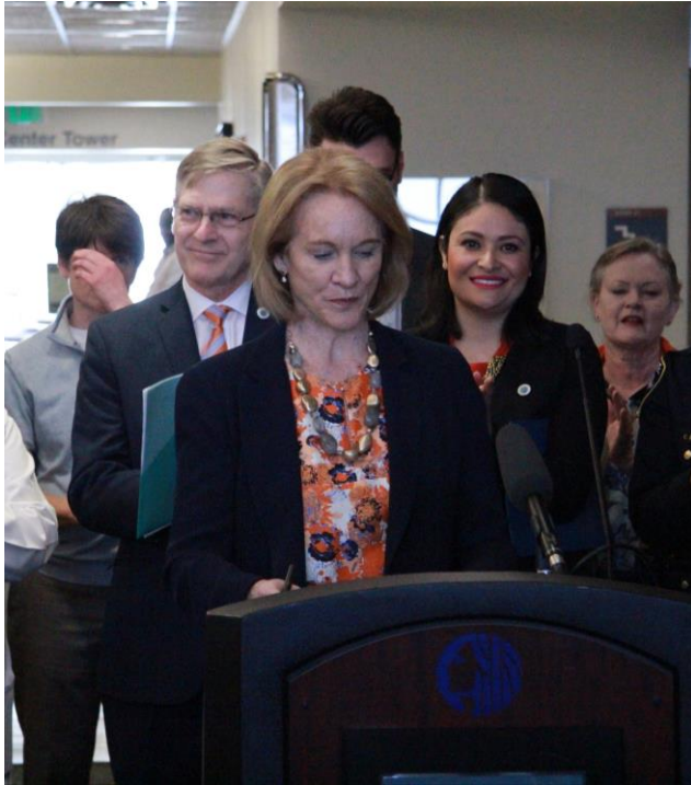
March 21, Harborview Medical Center