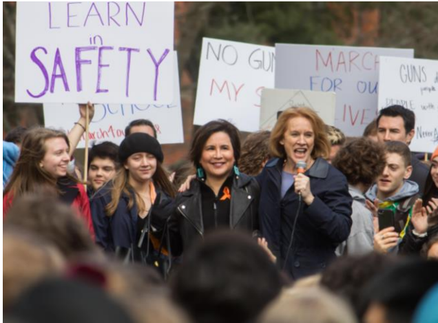
Nationwide student walk-out March 14th