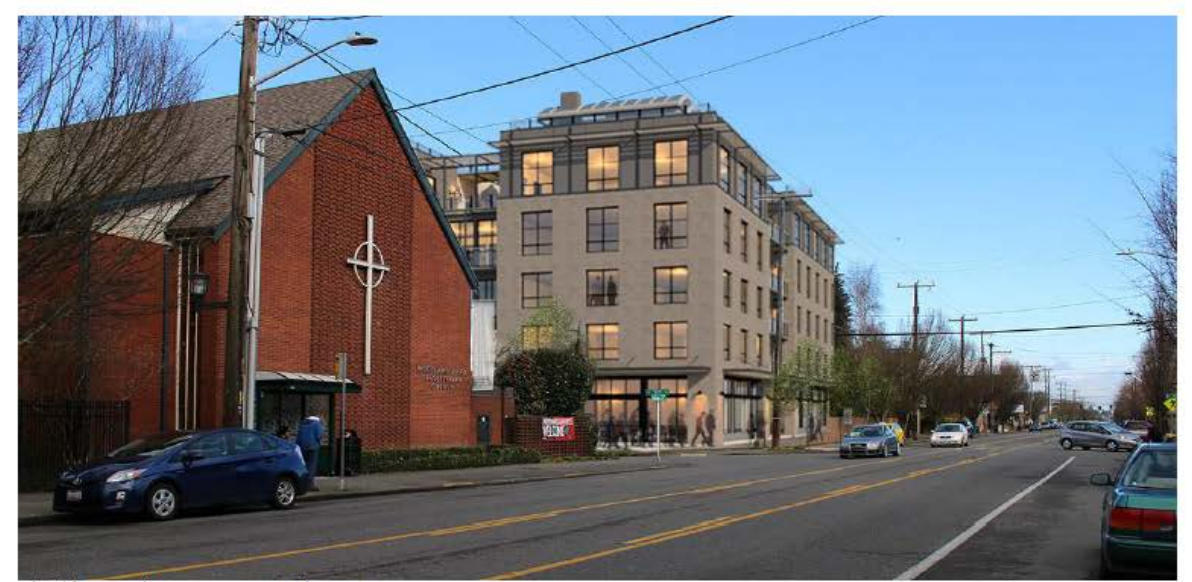
^ looking N along Greenwood Ave N