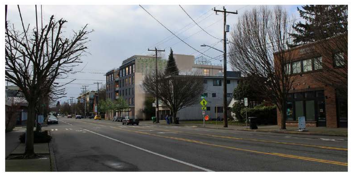
A looking S along Greenwood Ave N