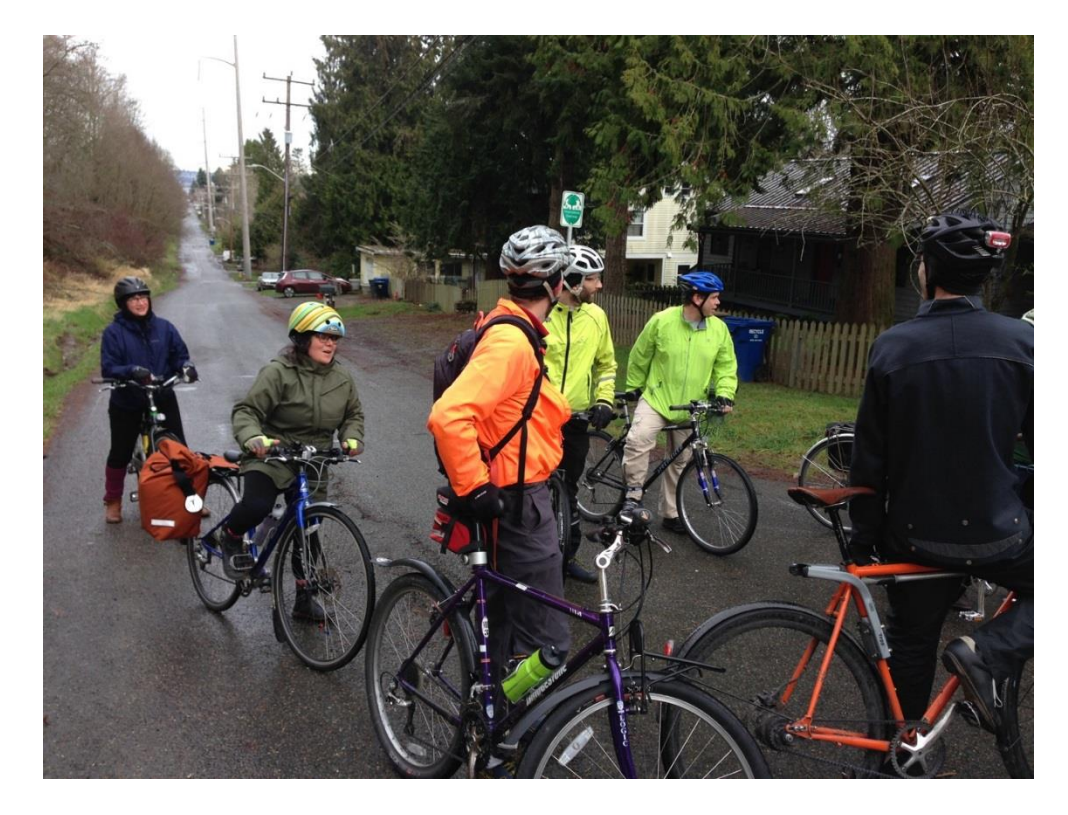
January 19 bike ride to discuss proposed route