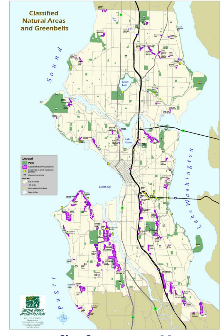
City Greenspaces Map