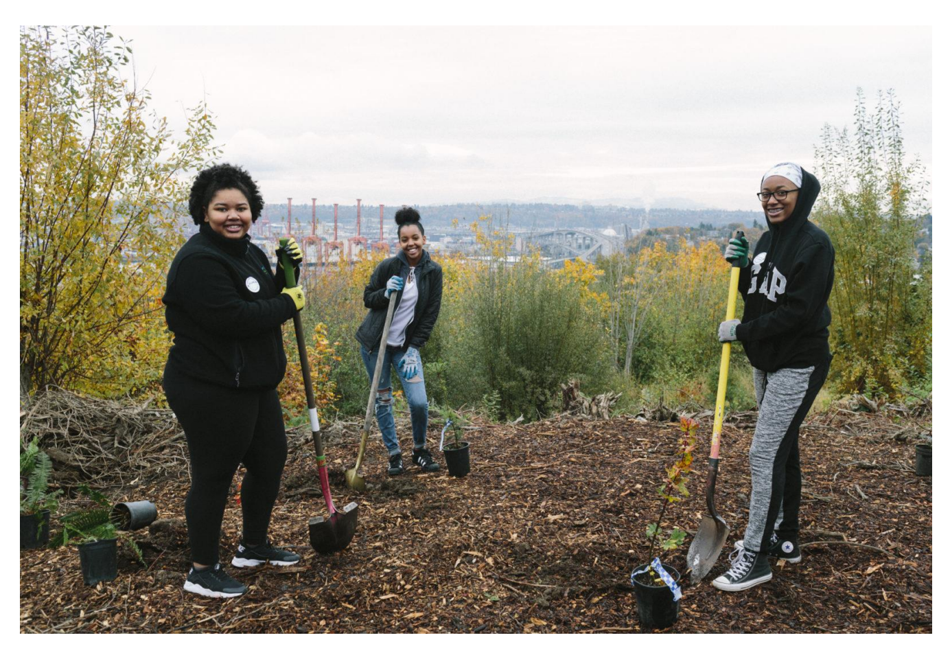
Duwamish Head Greenbelt Work Party