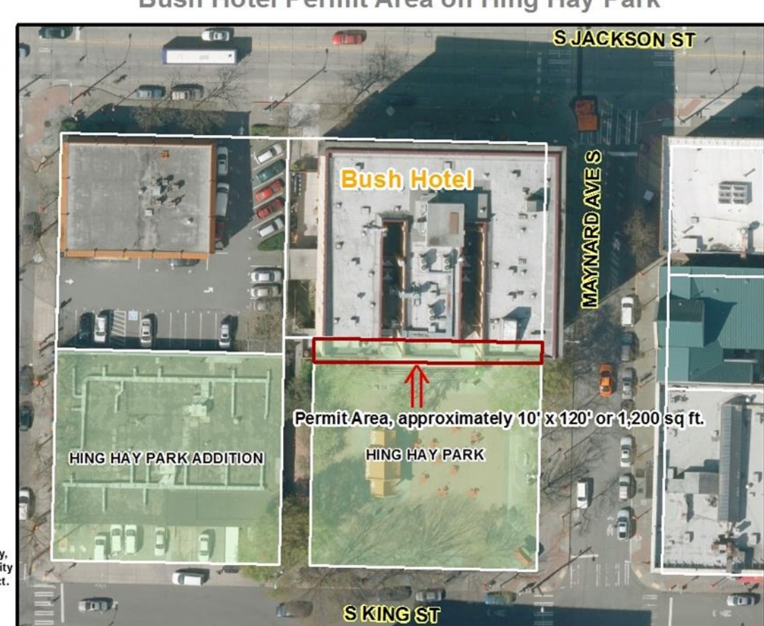
Exhibit I to the Indemnity Agreement Bush Hotel Permit Area on Hing Hay Park