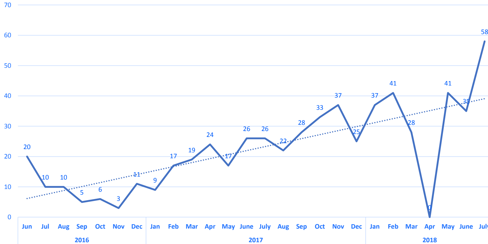
SFD Mobile Crisis Team Referrals