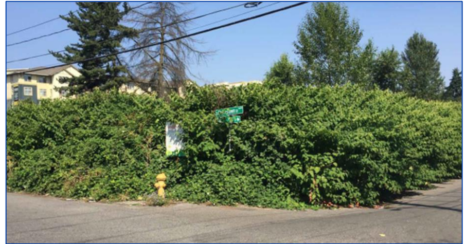
North Rainier Landbanked Site Park Development