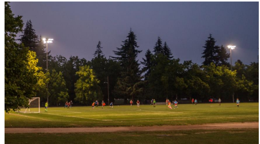
Lower Woodland Park Playfield #2