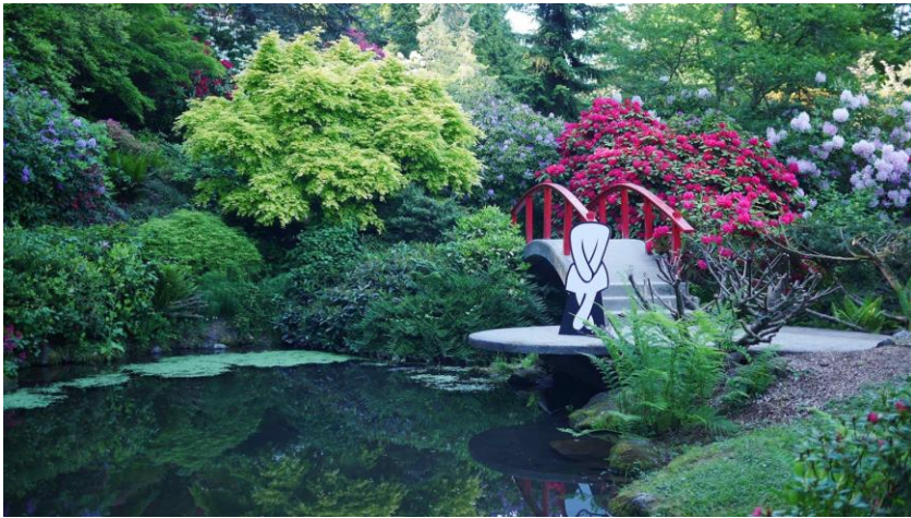
Kubota Garden Enhancements (Phase 1)