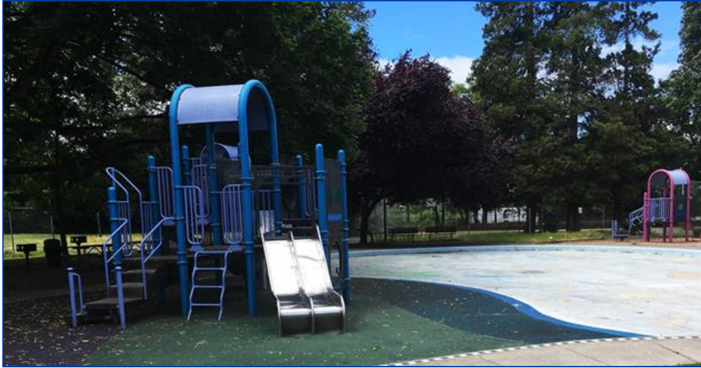
South Park Playfield, Playground & Spray Park