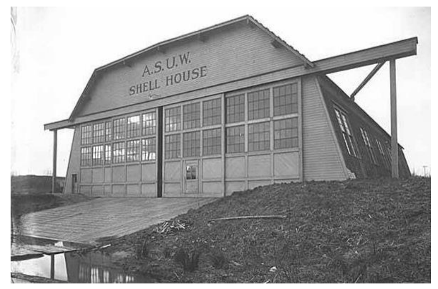
Historic photo, 1923