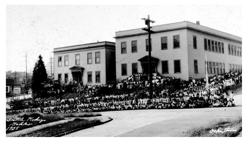
Historic photo, c.1935