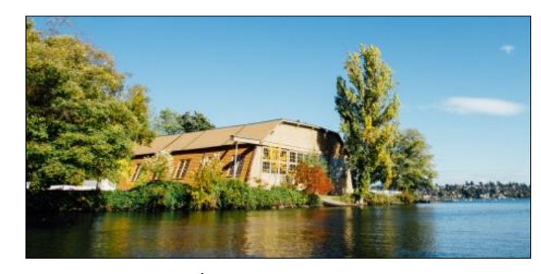
Contemporary photo, 2017