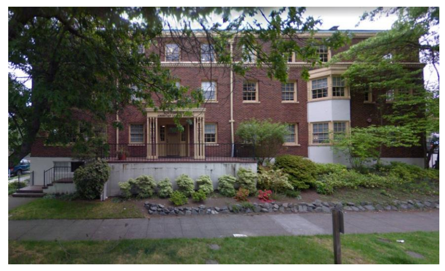
Contemporary photo, 2018