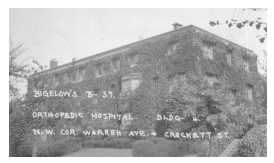
Historic photo, 1937