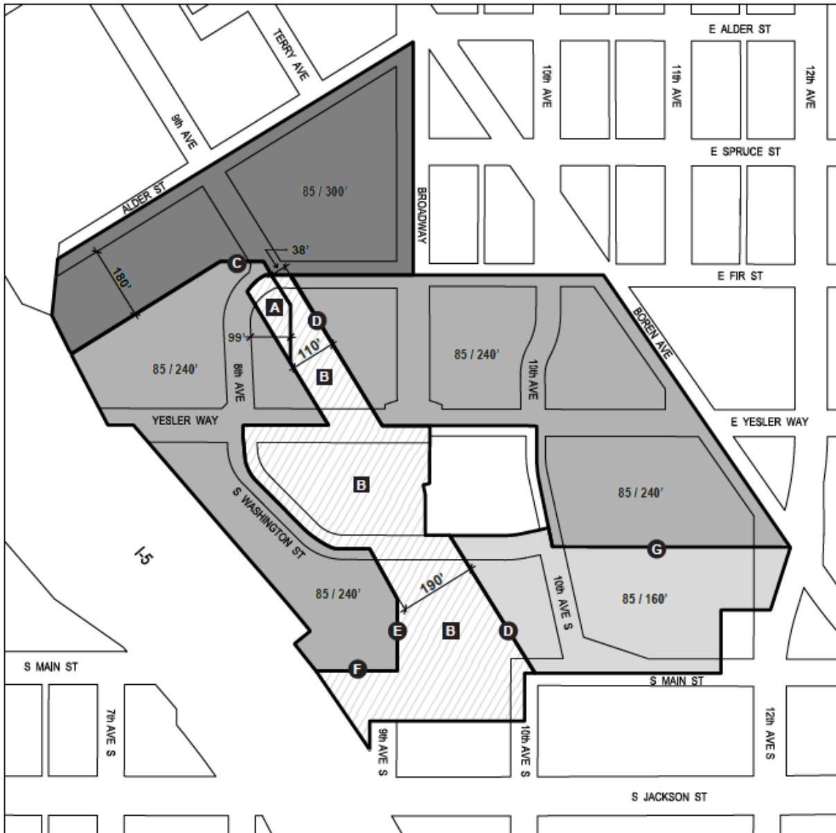
Exhibit A for Section 23.75.100 Height limits