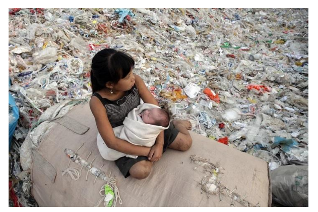
No domestic markets & concern about export of dirty film. Still frame from Jiu-Liang Wang's "Plastic China" documentary