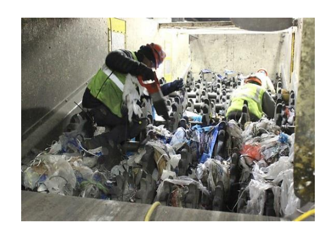
Enormous impacts on Material Recovery Facilities & contaminate paper. Recycling facility workers cut plastic bags & film out of sorting screens