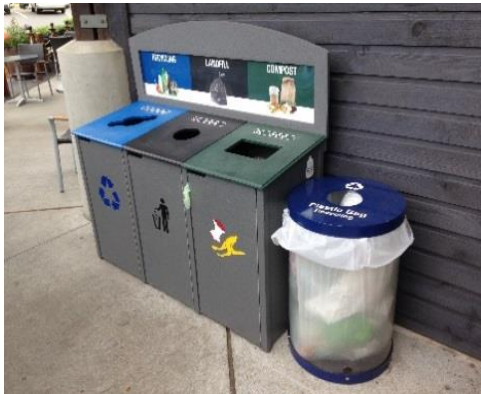
Example of Local Retailer Plastic Bag Take-back Location