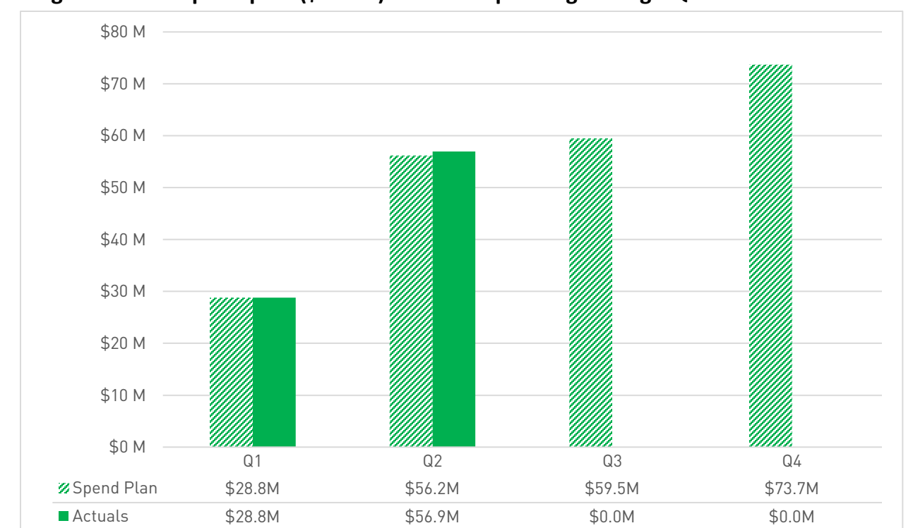
Figure 2: 2019 spend plan ($218M) vs actual spending through Q2 - ALL FUNDS