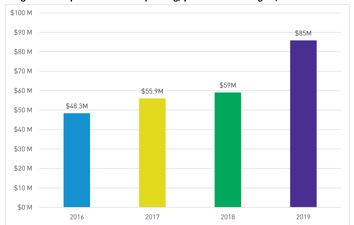
Figure 1: Comparison of actual spending, year to date through Q2 - ALL FUNDS