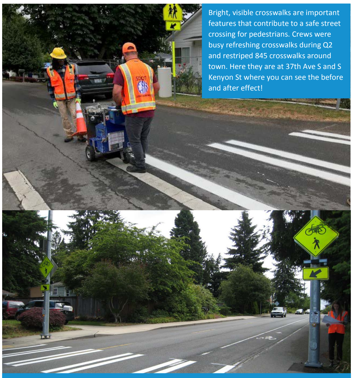
Improvements at NE 125th St and 38th Ave NE, built through the Safe Routes to School program, will help students walking and biking to Cedar Park Elementary School cross the street safely.