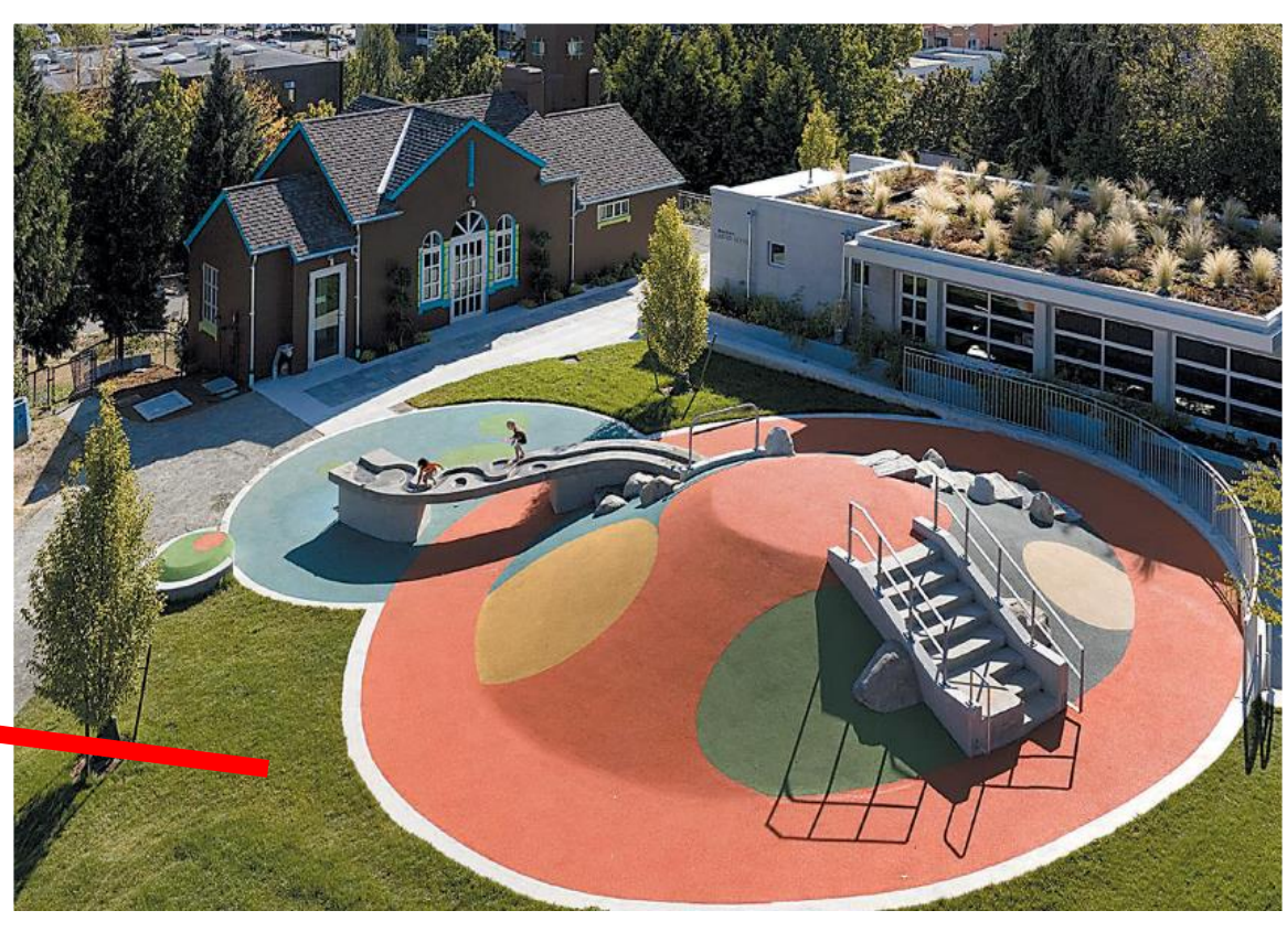
(Not to scale)