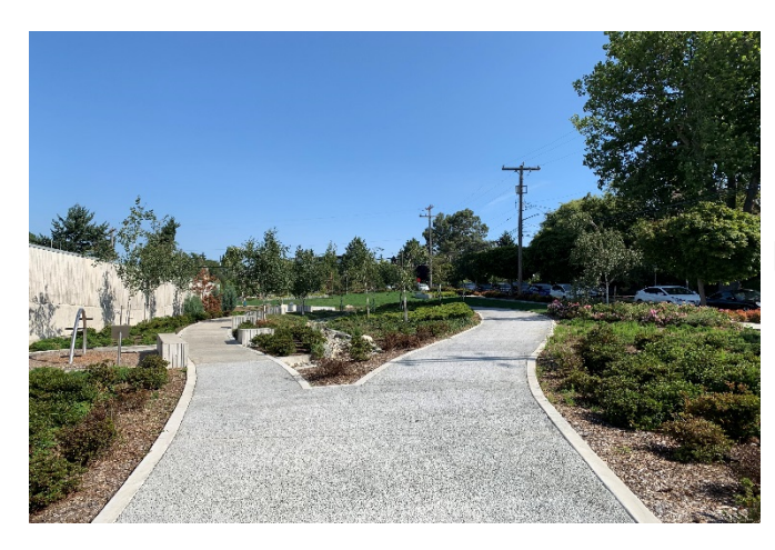
Olmstedian Walk, Landscaping - East property edge