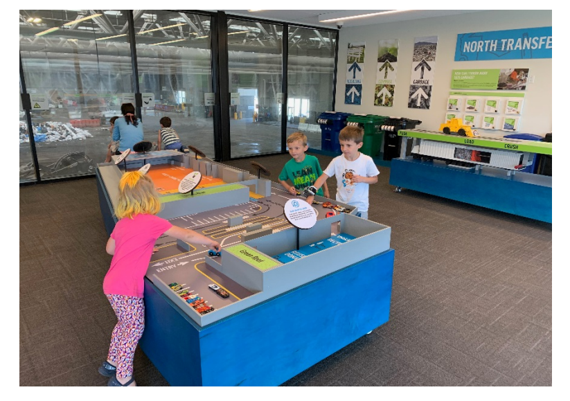
Example of educational material

Educate visitors and children about waste management and recycling.