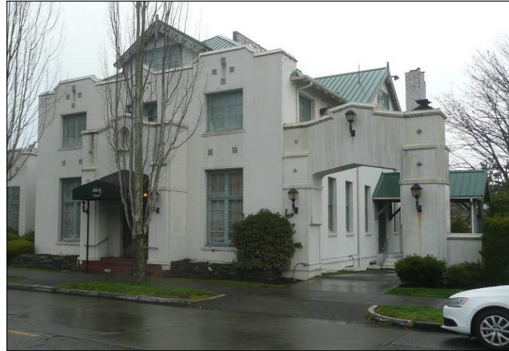
Contemporary photo, 2016