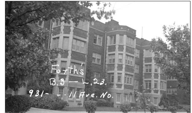
Historic photo, 1937