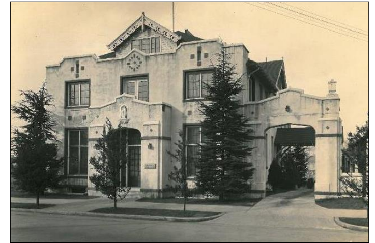
Historic photo, c. 1920s