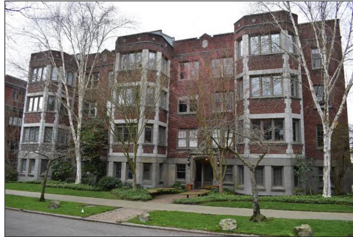
Contemporary photo, 2018