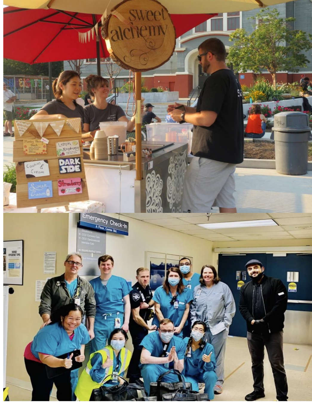
FEEDING THE UW MEDICAL STAFF