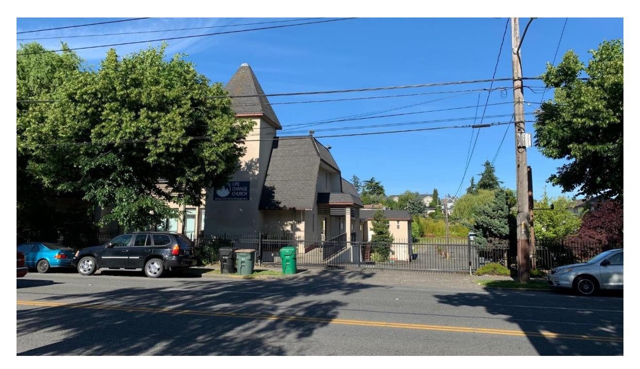
The Rose. St. cluster. View is looking east across Rainier Ave. S. to the existing Life Change Church structure on the site.