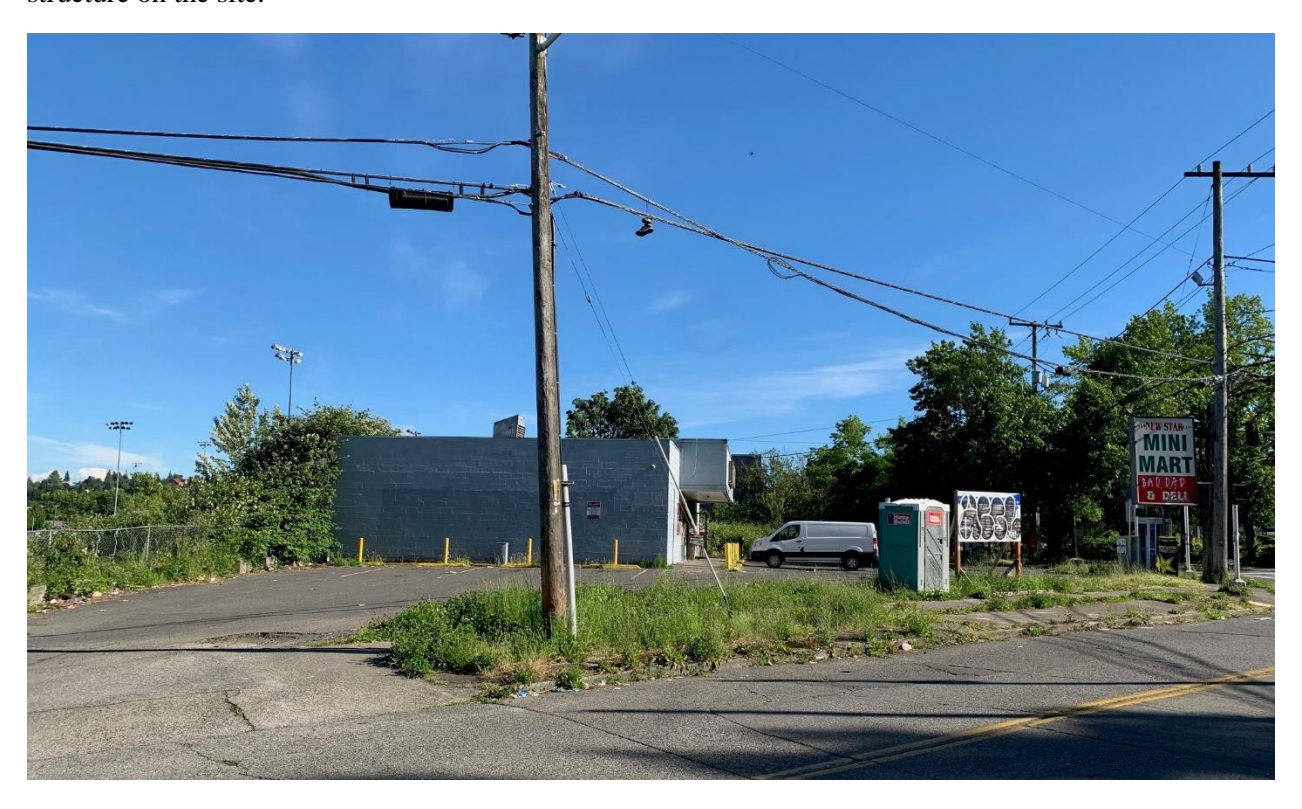
S. Cloverdale St. cluster. View is looking south at the site with the existing New Star Mini Mart on site and the Rainer Beach High School sports fields in the background.