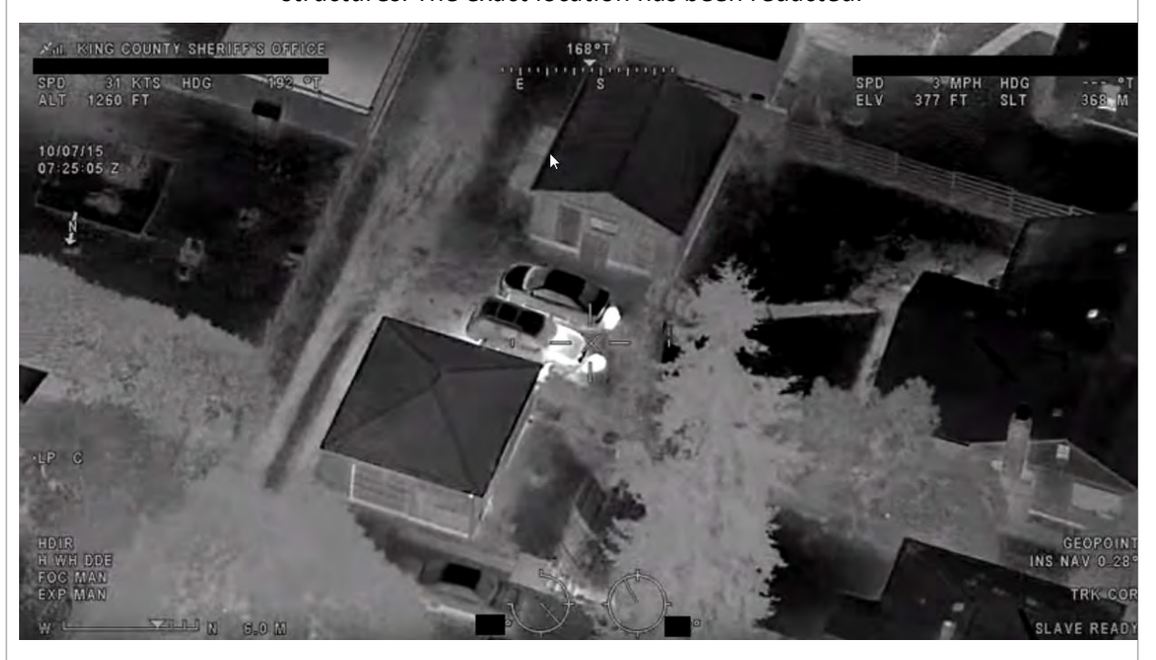
Example 2: A closer view of a residential structure illustrating Guardian One FLIR camera system capabilities.