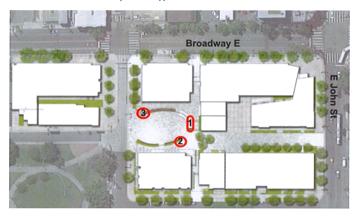
\underline{\textbf{Exhibit B}} Depiction of Approximate Location of AMP Art Installation