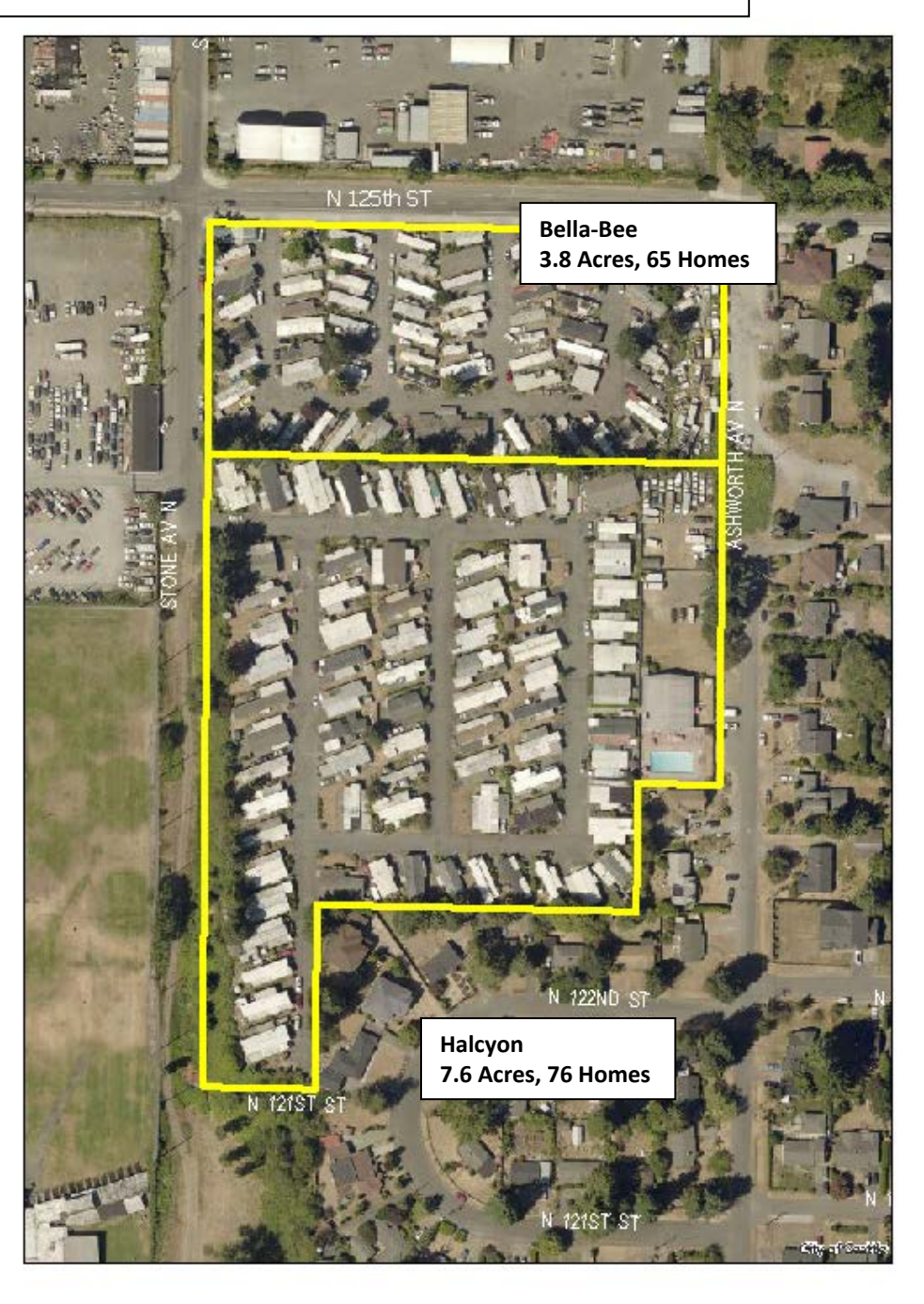
Figure 1: Remaining Mobile Home Parks

Together the mobile home parks are approximately 11 acres in area. The Bella-Bee and the Halcyon have approximately 65 and 76 mobile homes, respectively. The Bella-Bee was developed in 1956. The Halcyon was developed in the mid-1960s. Both mobile home parks are located over a decommissioned landfill. See Figure 1.