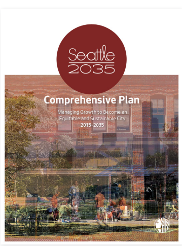
Cover of the Seattle 2035 Comprehensive Plan