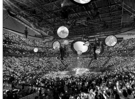
Coldplay's show, billed as Climate Pledge Arena's official grand opening, played to a sold-

ing attendance figures, but a crowd size likely in the 15,000 neighborhood counts as an underplay for the British stars who packed a stadium-sized show into a little hockey arena last night. I joke about the "little" part, but the clear sightlines and oft-touted tightness of the bowl really do make Clima