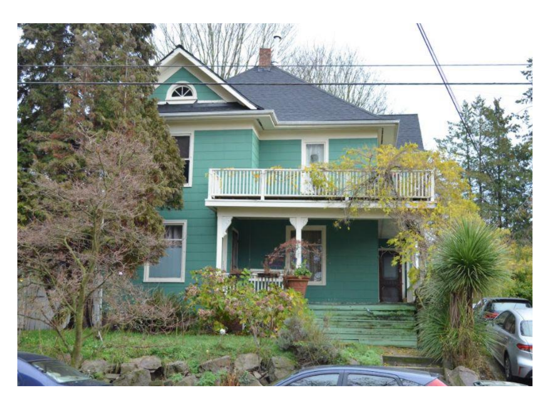
Cayton-Revels House , 518 14<sup>th</sup> Avenue E, 2020