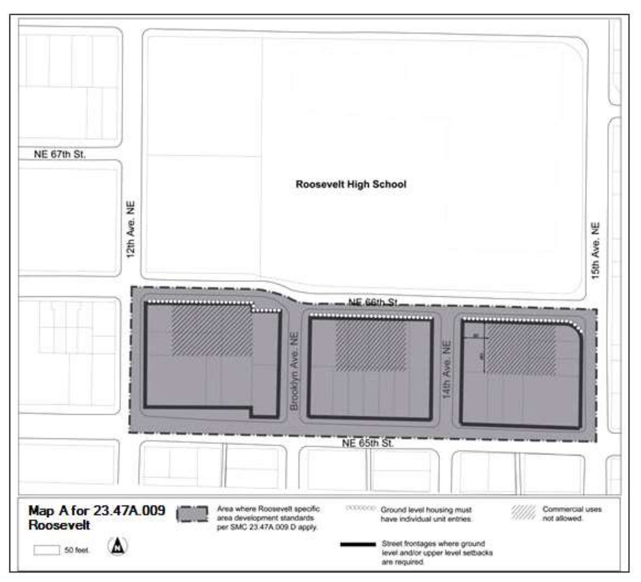
<https://www.municode.com/Api/CD/StaticCodeContent?productId=13857&fileName=23-47A-009.png> 1. Setback requirements

a. The following setbacks are required from the listed street property lines: