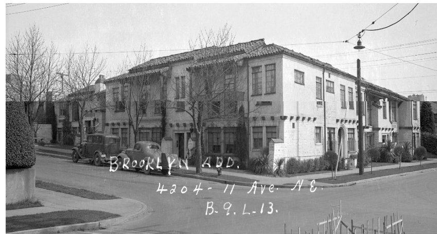
Historic photo, 1937