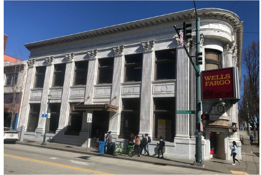
Contemporary photo, 2019

Architect: 1913 - George F. Hughes & Beezer Brothers; 1927 - Merriam & Doyle