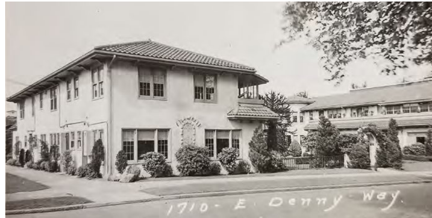
Historic photo, 1937