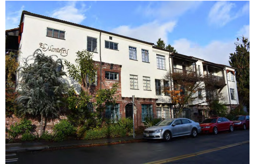
Contemporary photo, 2020