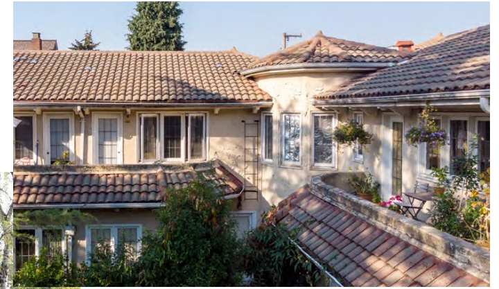
Contemporary photos, 2021