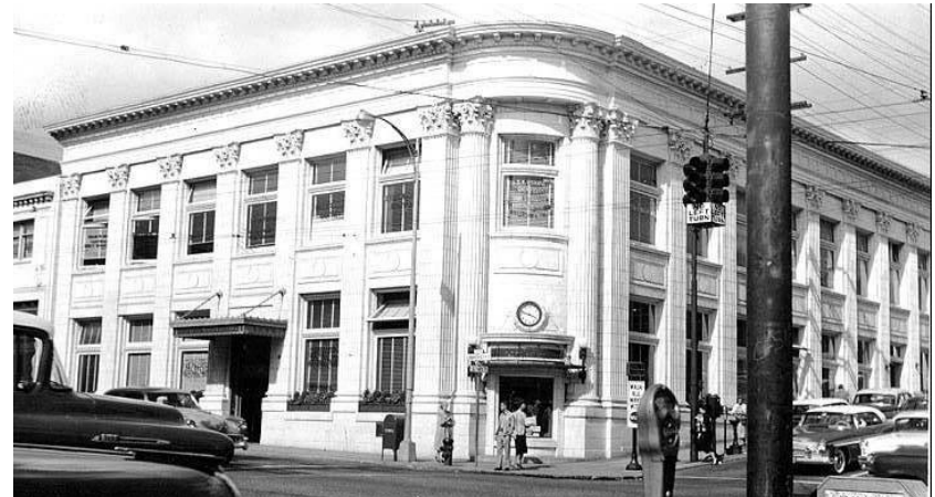
Historic photo, 1957