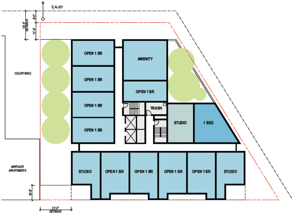
Floor Plan (Level 2)