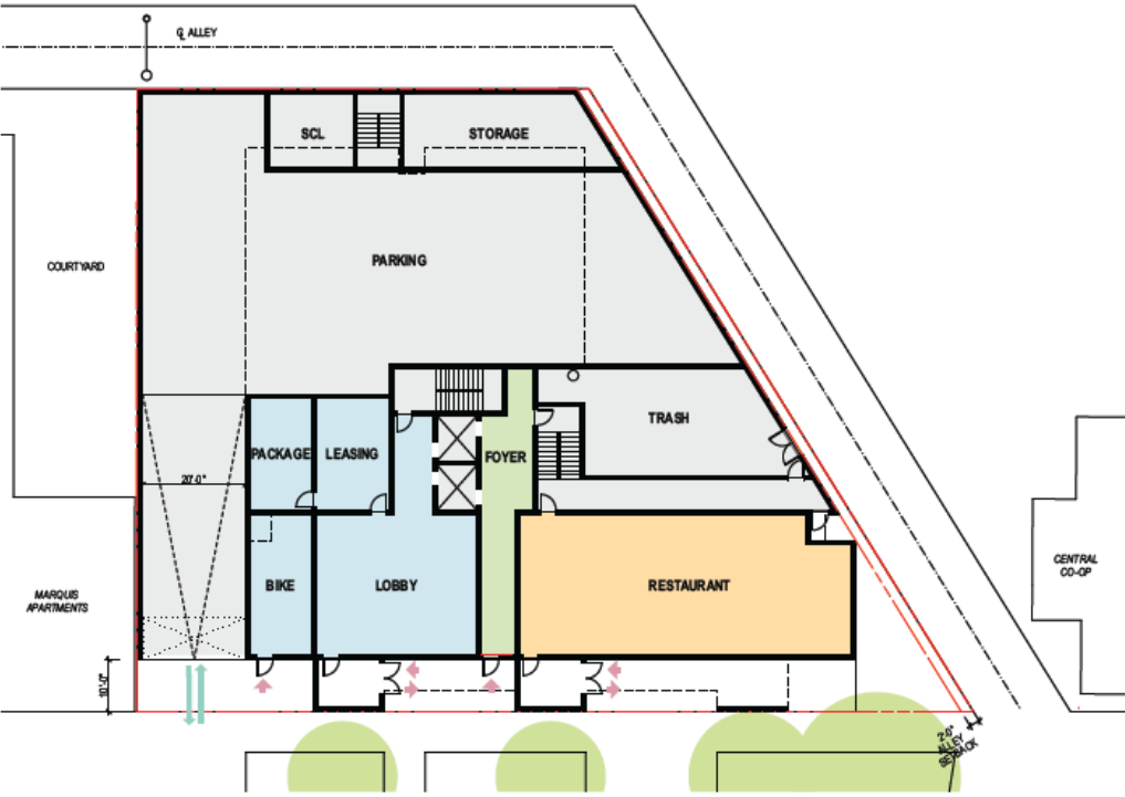
Street Level Floor Plan (Level 1)