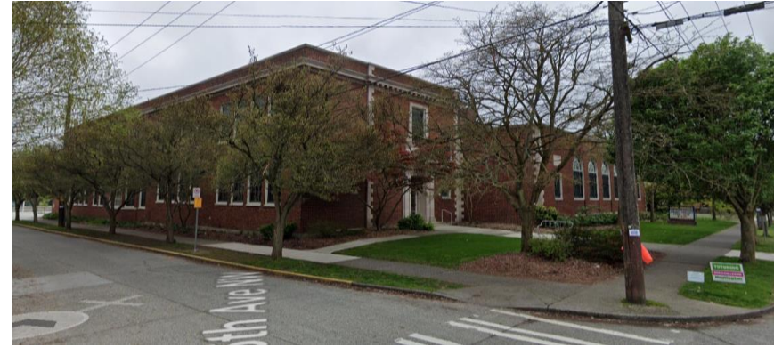
Contemporary photo, 2021