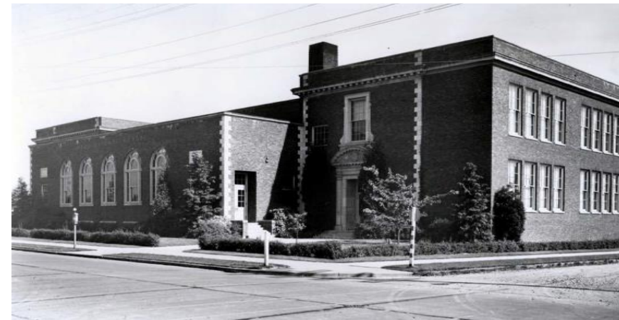
Historic photo, 1939