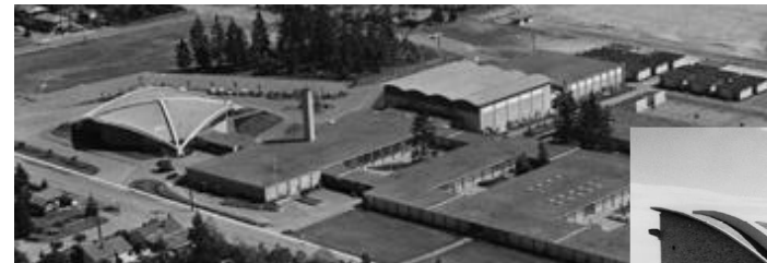
Historic photos, 1960