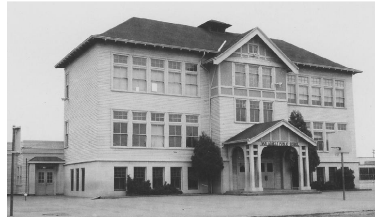
Historic photo, circa 1950