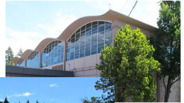
Contemporary photos, 2017