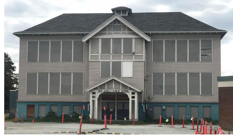
Contemporary photo, 2018