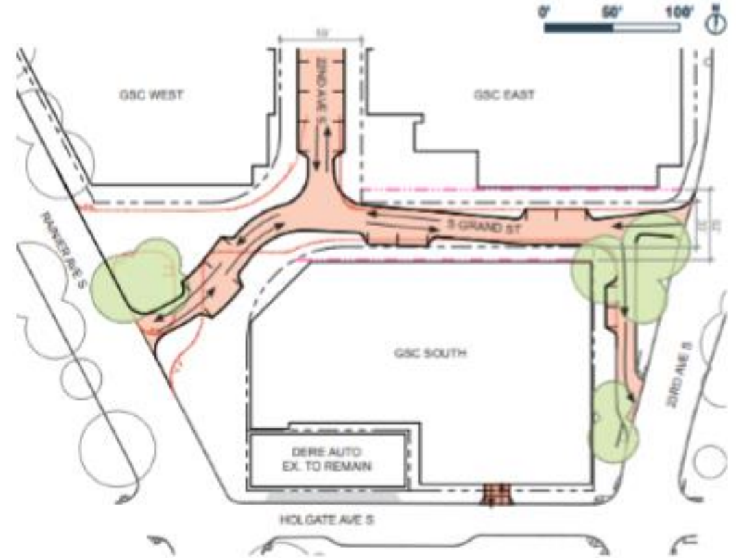
ALLEY VACATION GRAND ST. REALIGNMENT