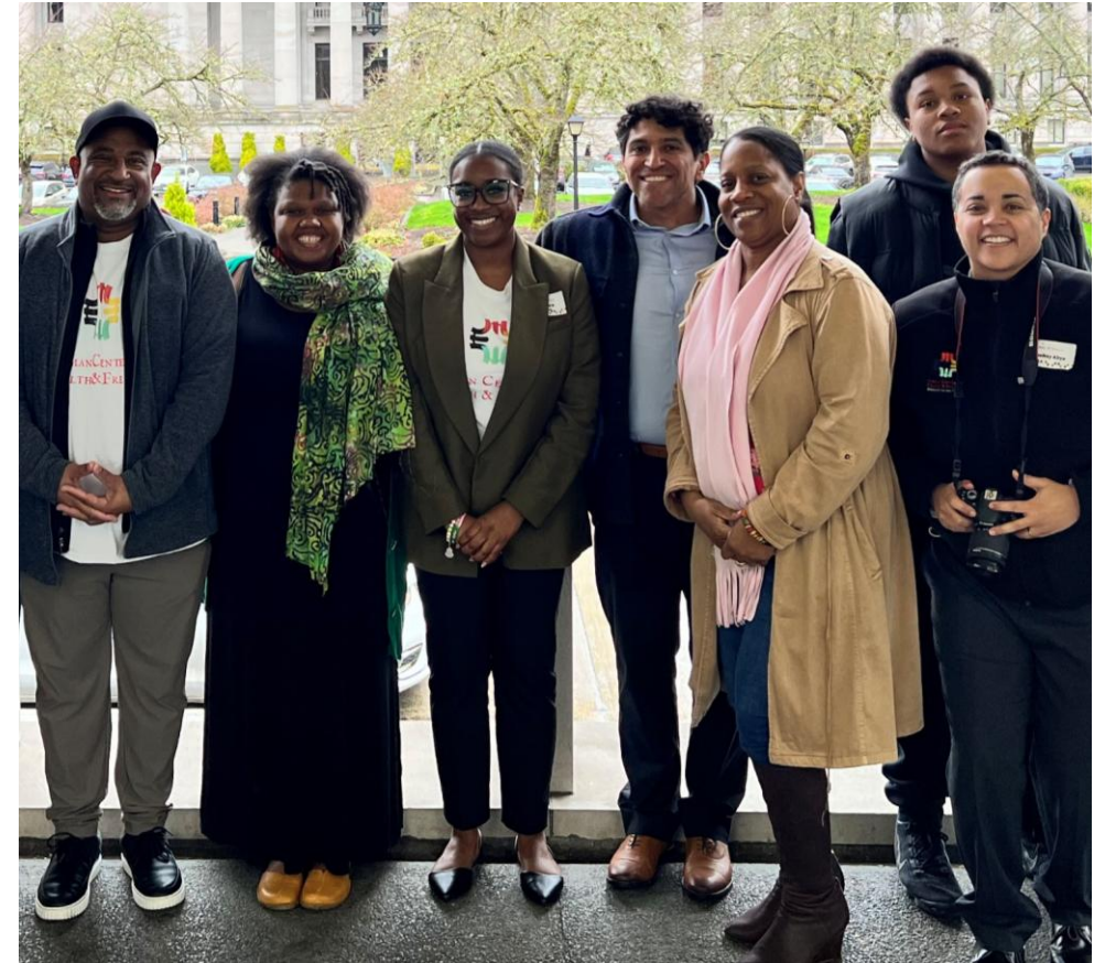
Tubman Center for Health and Freedom