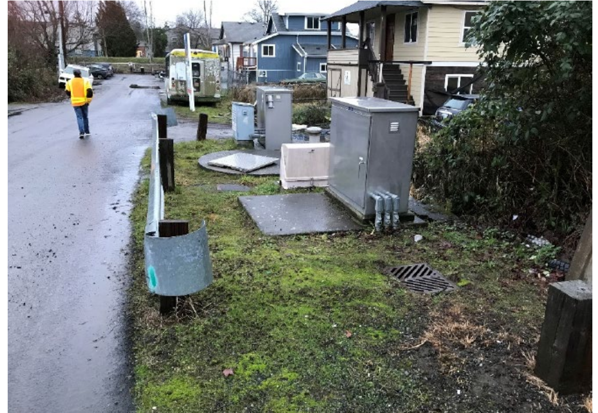
Existing Pump Station in Right-of-Way