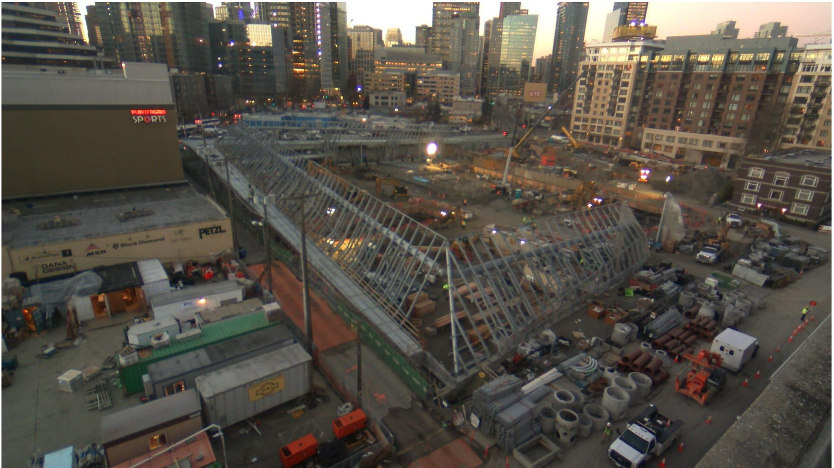
VIEW OF DENNY SUBSTATION SITE ON JOHN STREET (LOOKING SOUTH)