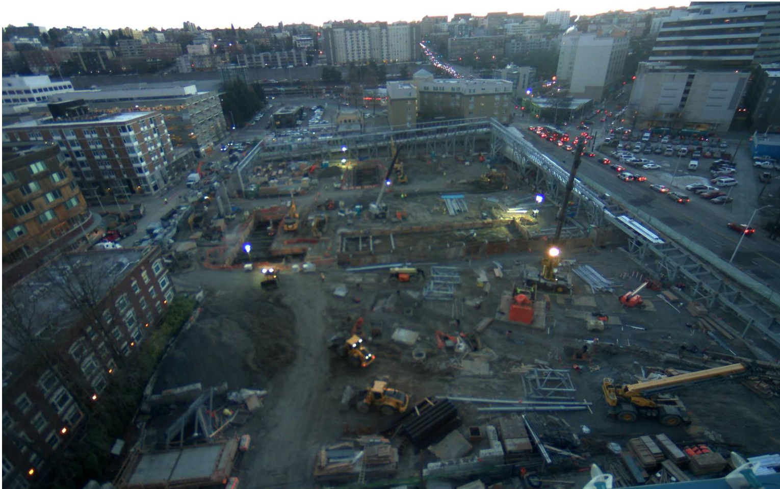
VIEW OF DENNY SUBSTATION CONSTRUCTION SITE ON MINOR AVE N (LOOKING EAST)