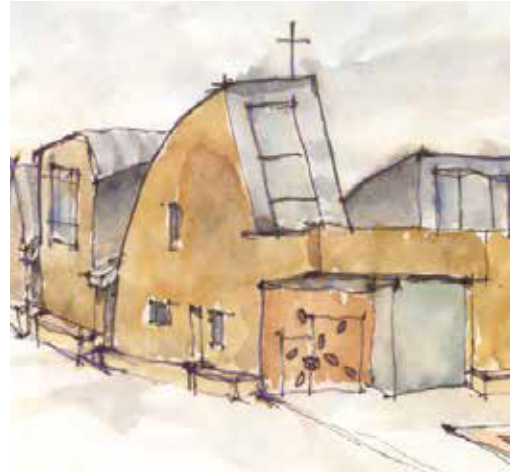
Painting and Sketching ongoing pen, pencil, watercolor and encaustic