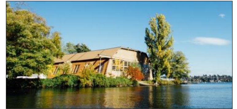
Contemporary photo, 2017