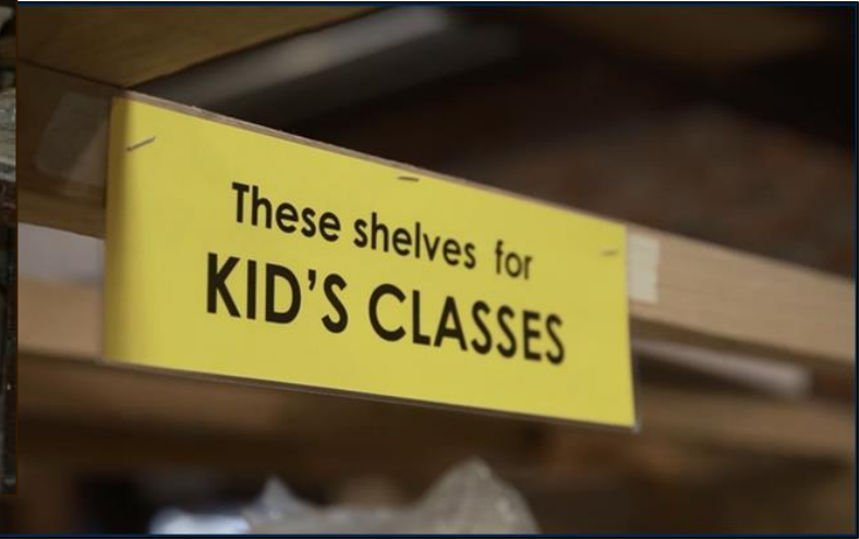
Exhibit C: PUBLIC BENEFITS AS USE FEE OFFSETS

The proposed lease allows SPCS to offset the Use Fee with the value of the public benefit provided by the organization: