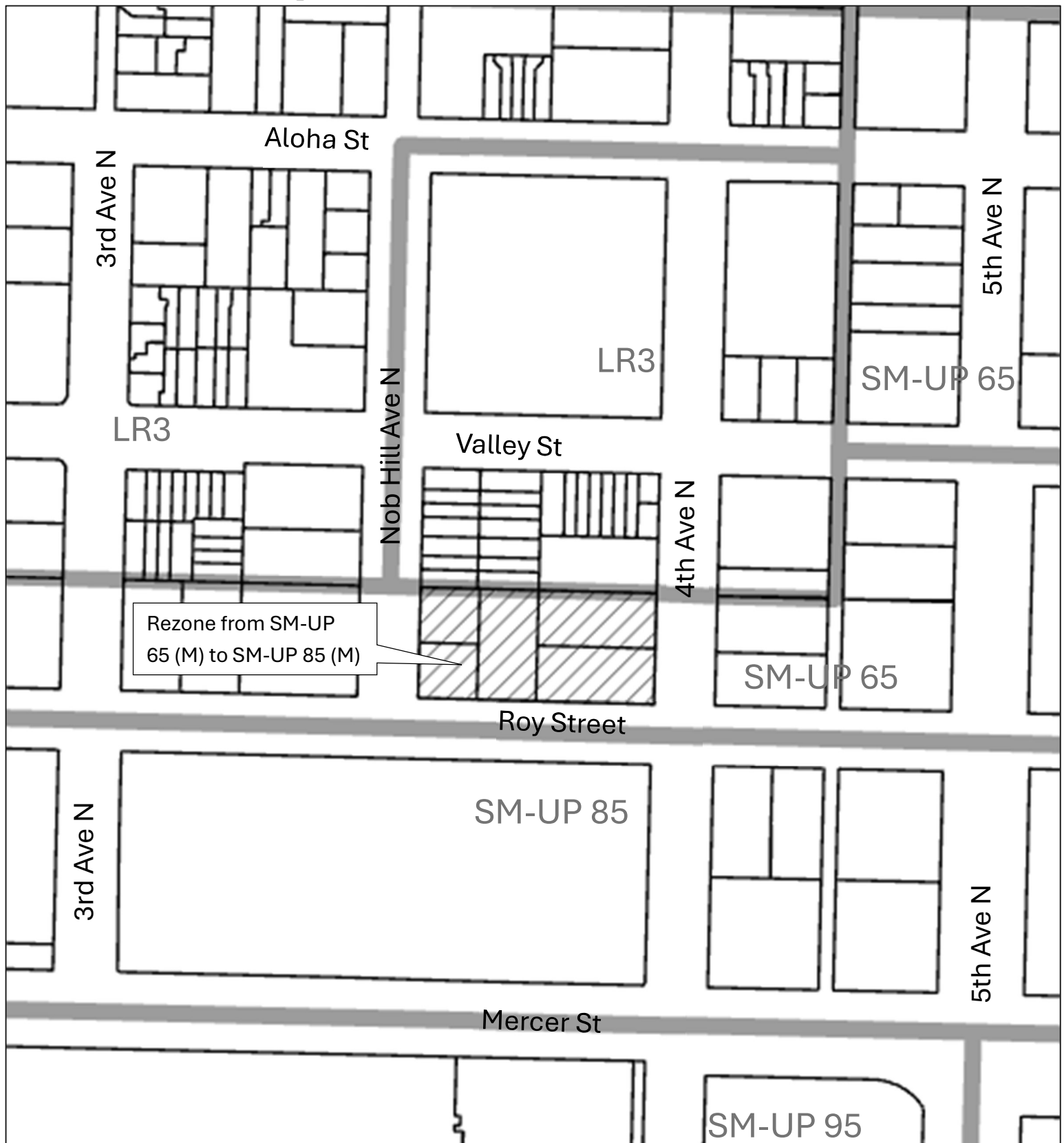
Exhibit A - Rezone Map