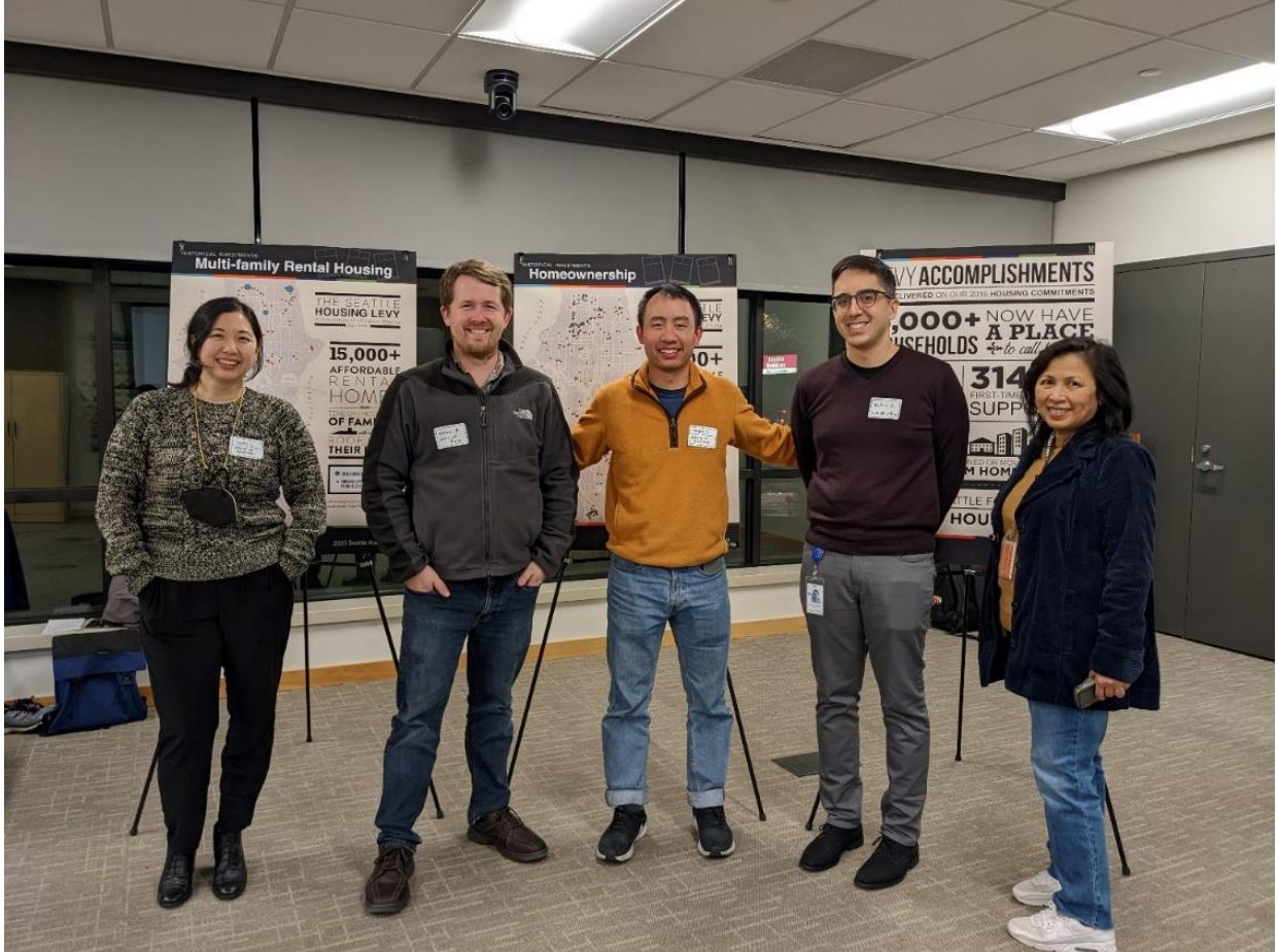
Housing Levy Open House at Hobson Place, December 6, 2022