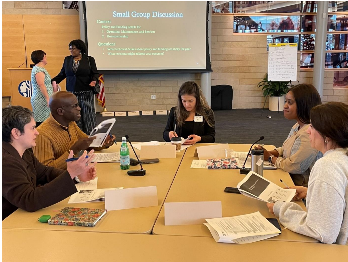
Housing Levy Technical Advisory Committee meeting, November 18, 2022